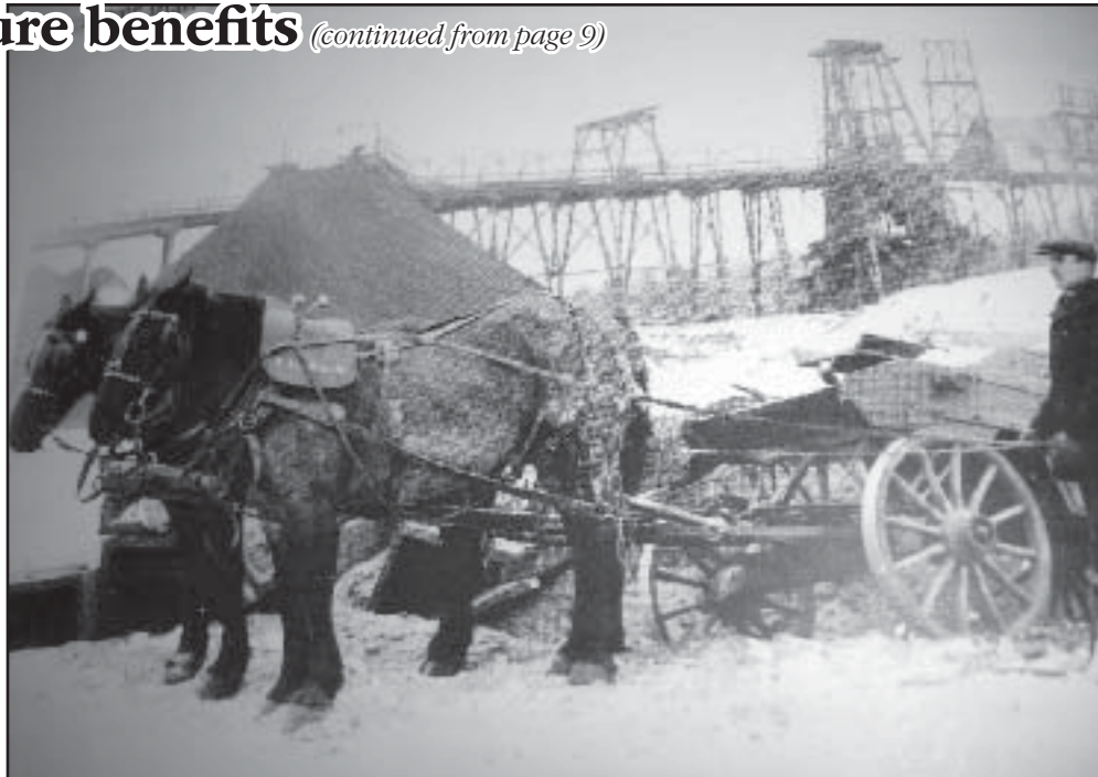
Horse and mules were an integral part of early mining efforts. A hopper wagon at Armour I Mine, used for collecting and hauling dirt.

Mining on the Cuyuna Range continued until competition from taconite production and rising cost factors proved too great to con-