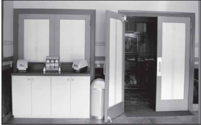
The lobby of the Rialto with geometric art deco design.