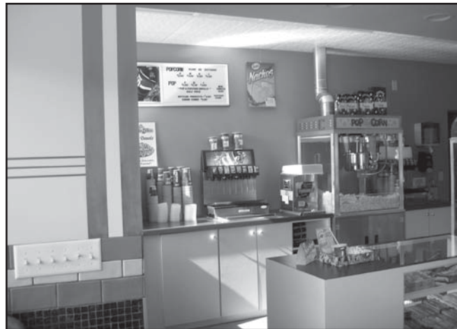
The remodeled concession stand, a perfect blend of past décor and modern design that allows for new products.